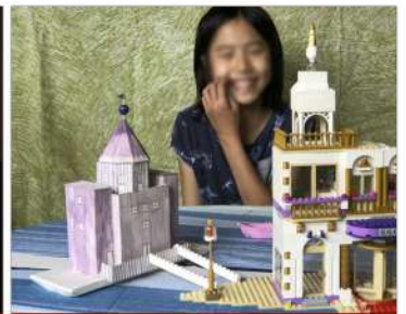
A work of art anchored in the harbour of Venice made from Lego.