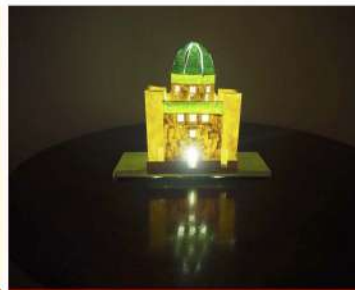
Night scene work on the sea, with LED lighting installed.